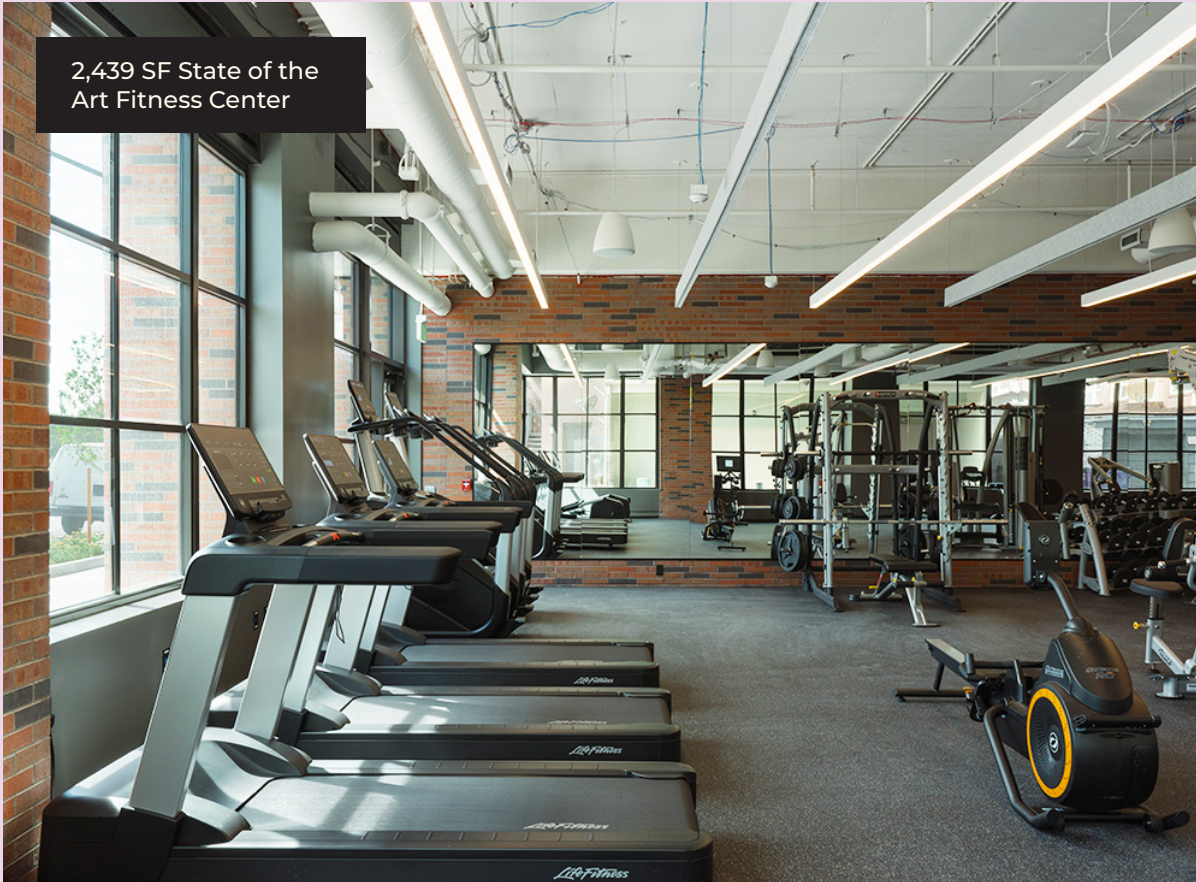
2,439 SF State of the Art Fitness Center